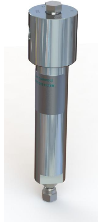
CVS Series 252 Filter

NACE Compatible. Providing a filtration capability of 20 microns. Maximum working pressure of 2750 psig.